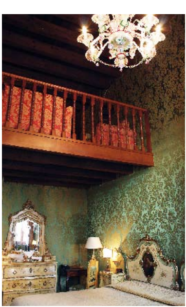
UNMASKED ... Venice's Grand Canal, opposite; lamps in Piazza San Marco; an industrious Venetian in Cannaregio; an aged door; view from Palazzo Abadessa, and the writer's charming suite.